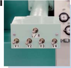
Valve switch box Enables to operate frame changing mechanisms individually. (Option)