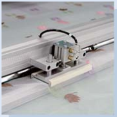
Fabric clamping device