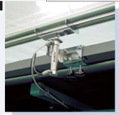
Fabric serpentine feed preventing mechanism Fabric is fed in the stretched conditions to realize stabilized fabric feed, free from serpentine.