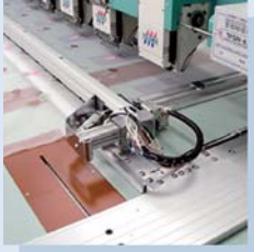
Fabric clamping device Fixes fabric securely, providing appropriate tension to the fabric.