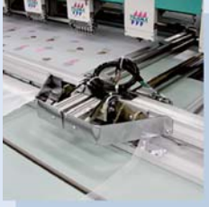
Fabric clamping device