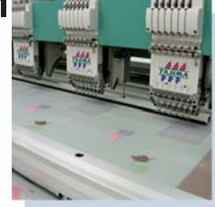
Needle base presser Prevents fabric from being displaced while the fabric is fed.